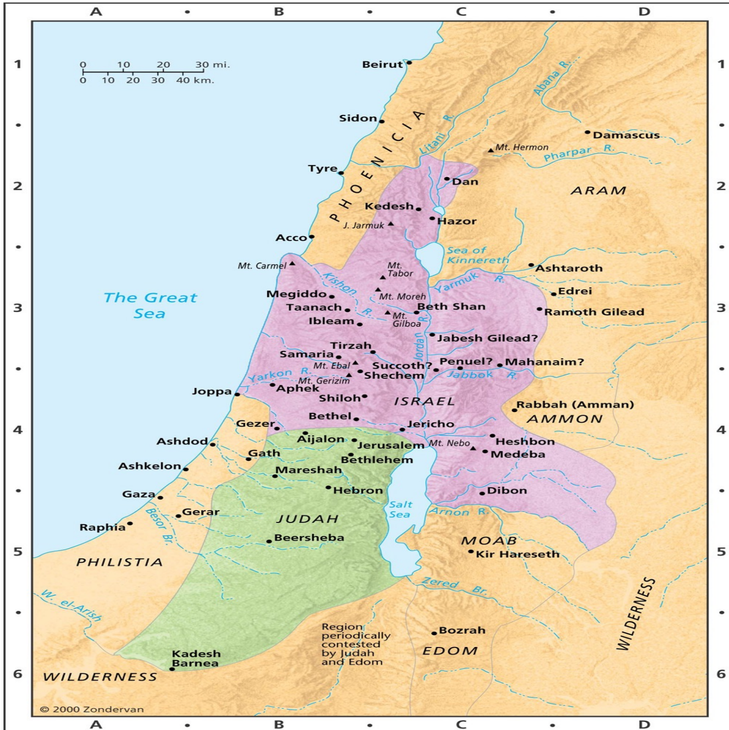
Map 6: KINGDOMS OF ISRAEL AND JUDAH