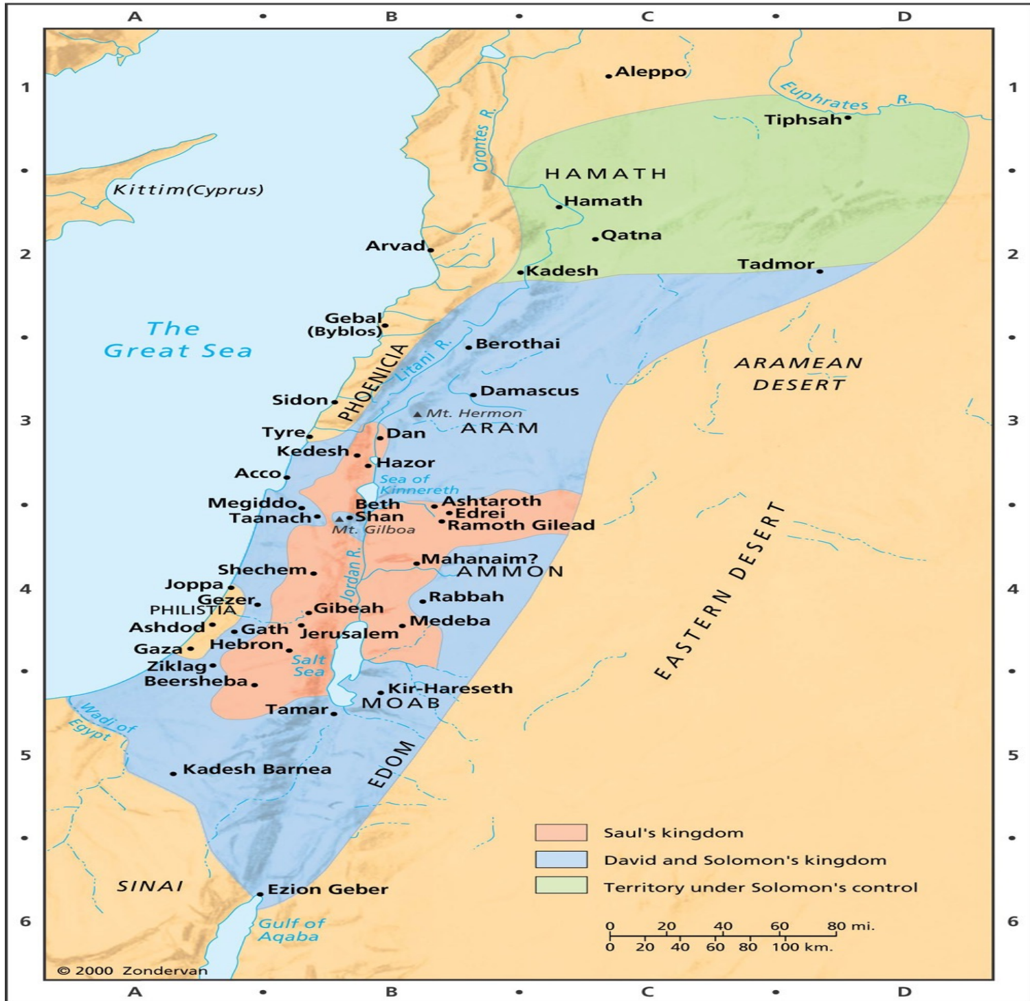
Map 5: KINGDOM OF DAVID AND SOLOMON